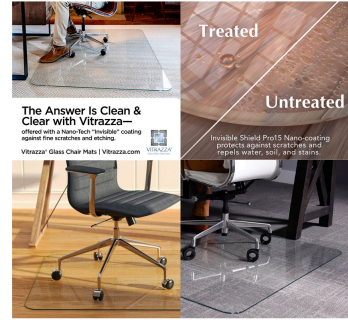
The Answer Is Clean & Clear with Vitrazza™ offered with a nano-tech "invisible" coating against fine scratches and etching. Vitrazza® Glass Chair Mats | Vitrazza.com Vitrazza Glass Chair Mats Vitrazza's femora glass floor mats have included the Invisible Shield nanotech coating to help prevent etching, scratches for an easy, smooth glide.