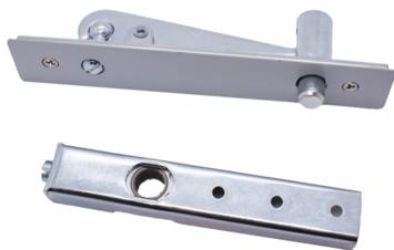
Adjustable top centre with \phi 12.5\text{mm} pin